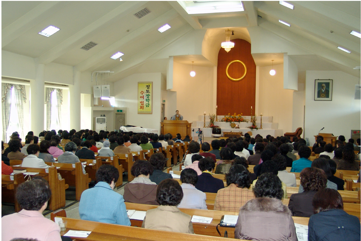
A typical Sunday service