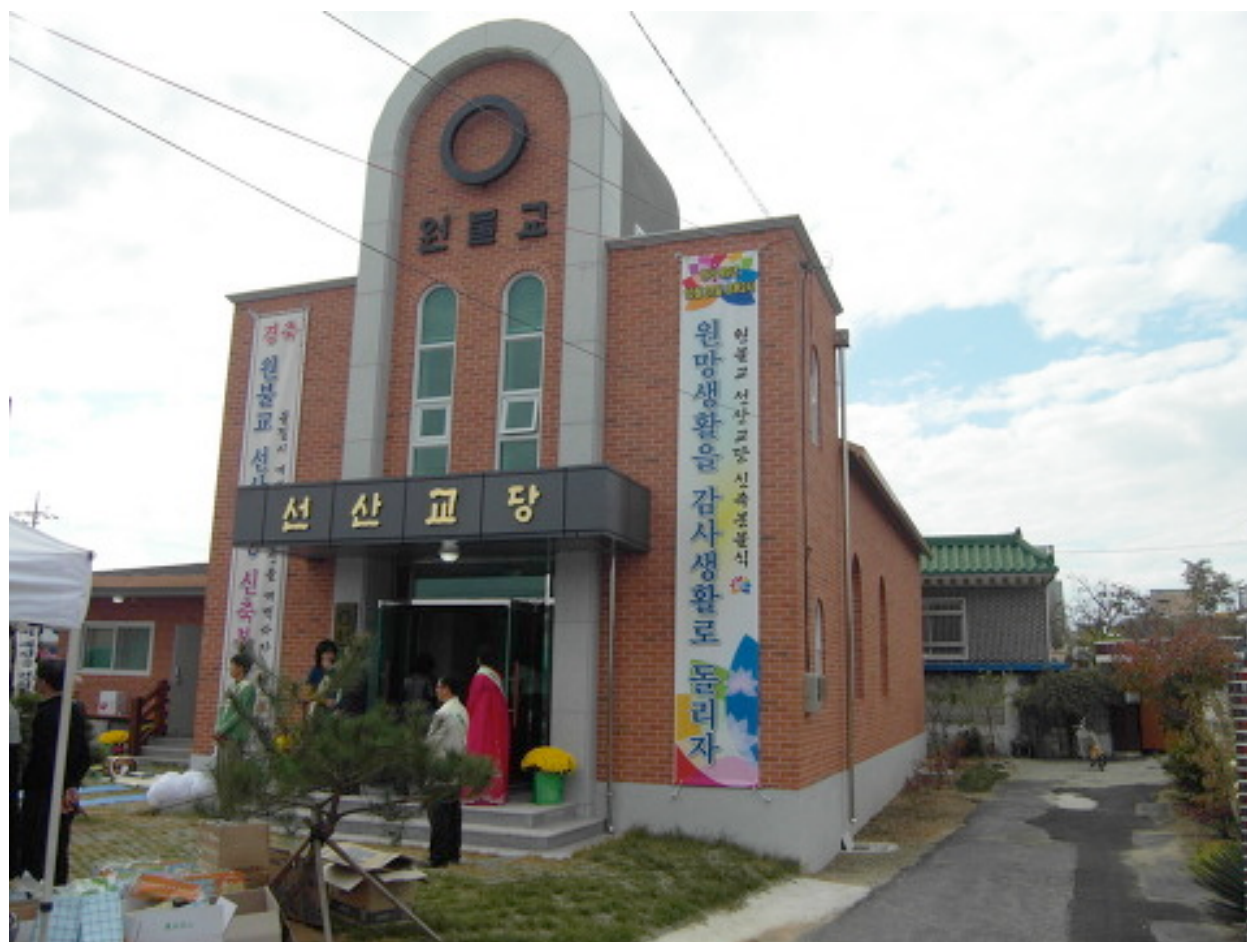
A typical Won Buddhist urban temple.