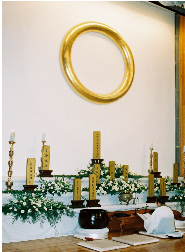
Directing the spiritual gaze at the Ilwönsang

interact with other supernatural personalities. 7 Early in the 20th century, another new religion appeared which then fragmented into a cluster of new religious organizations focused on the worship of Kang Chŭngsan (1871-1909), whom they call Sangjenim, the Lord of High. Though the Kang Chŭngsan religions are not strictly monotheistic, since they preach the existence of many powerful supernatural personalities, their emphasis on Sangjenim as the incarnation on earth of the supreme lord on high and the most powerful by far of all the gods shows that they, too, have been influenced by the monotheism Catholicism introduced to Korea. Won Buddhism emerged after Tonghak had been preaching its theology for over half a century, and a decade after Kang Chŭngsan left this earth. However, Won Buddhists didn't adopt the God of Catholicism, of Tonghak, or of the Chŭngsan religions. Instead, they promoted what may be called a mono-devotional rather than a monotheistic approach. Influenced by the new trend away from polytheism, Won Buddhists have excluded from their worship halls the many statues found in traditional Korean Buddhist temples. In their place, they have a circle, called Ilwönsang, which they use to represent the undifferentiated thusness of ultimate reality. (In a bow to the Buddhist elements in Won Buddhist teachings, they also call that circle the Dharmakaya Buddha). 8