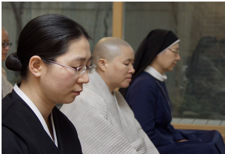
From left to right, a Won Buddhist nun, a mainstream Buddhist nun, and a Catholic nun.