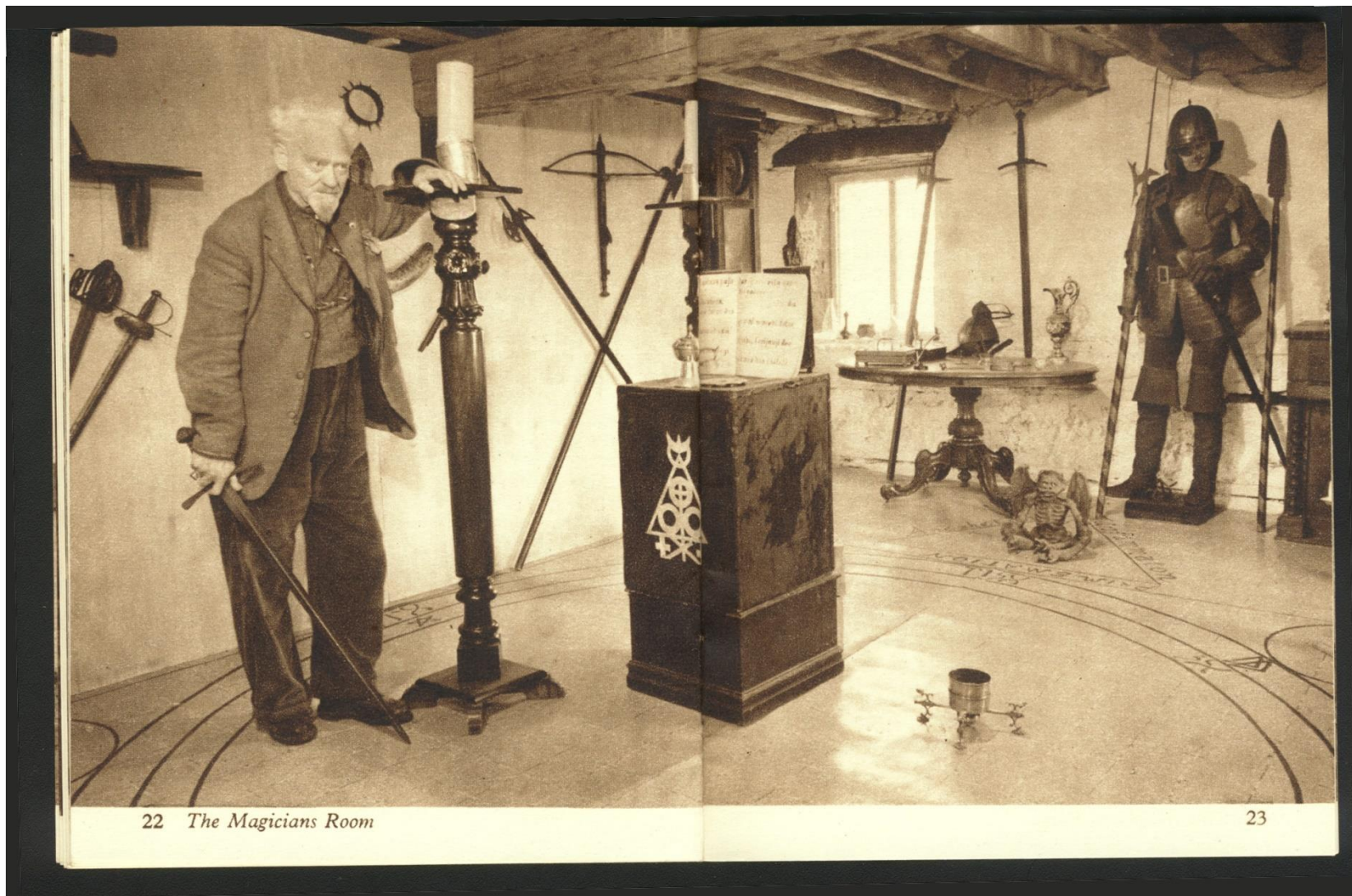
22 The Magicians Room