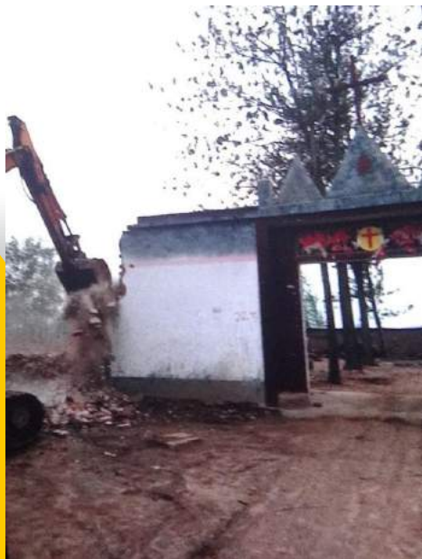
A church is destroyed in Yucheng, Henan - Exclusive photo smuggled from China for Bitter Winter

Bitter Winter is a cooperative enterprise by scholars, human rights activists, and members of religious organizations active in China (some of them have elected, for obvious reasons, to remain anonymous). It is independent from any religious or political organization, although welcoming the cooperation of many, and the fruit of volunteer work by those who work on it, although donations are gladly accepted.