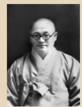
Bak Jungbin (1891–1943) *1916