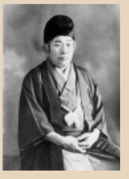
Deguchi Nao (1836– 1918) Deguchi Onisaburō (1871– 1948) *1892