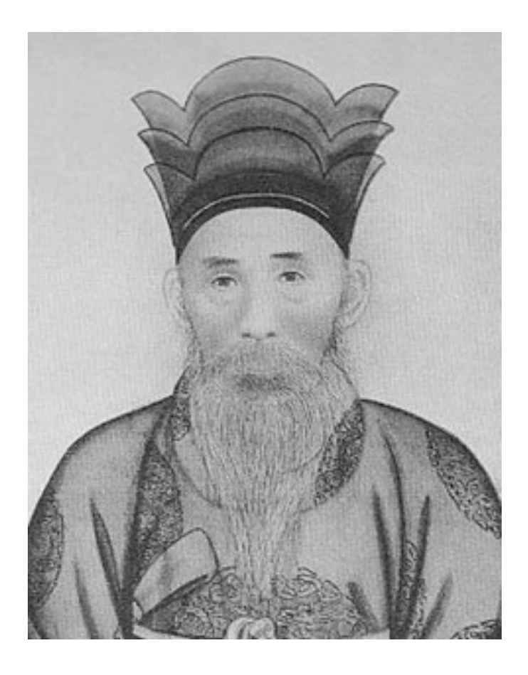
Cho'e Sihyung, the second leader of Eastern Learning