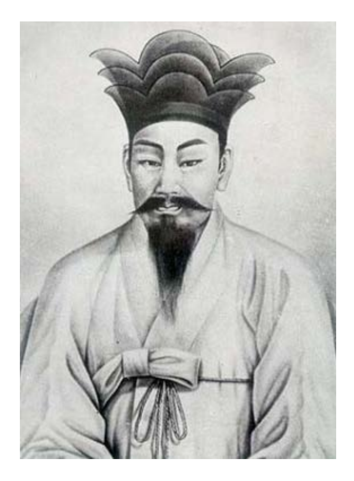
Cho'e Cheu, the founder of Eastern Learning